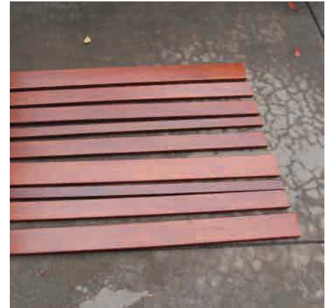
STEP 6. Prepare your desired cladding.