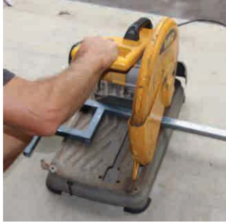
STEP 2. Measure your opening & if required, make a simple straight cuts to alter gate height / width.