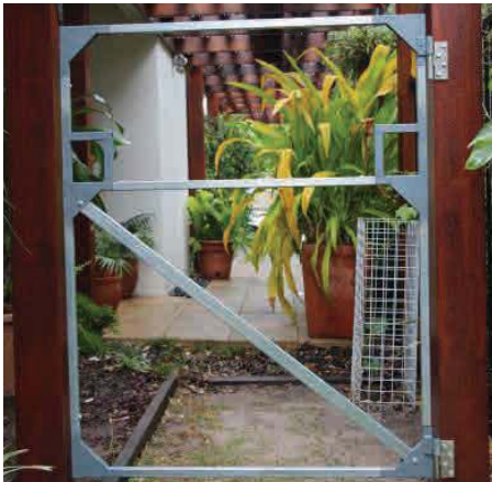
STEP 5. Hang your Quick Frame gate to ensure correct fit.