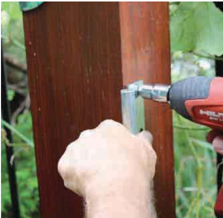
STEP 4. Hang your hinge receivers to post or wall.