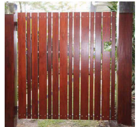
STEP 9. Enjoy.

For more information contact our distributor: