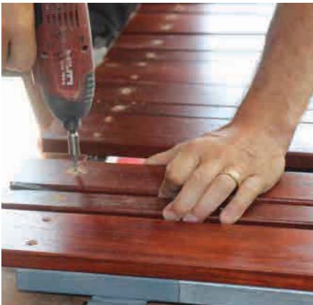
STEP 7. Fix your gate or panel cladding to your Quick Frame gate or panel.