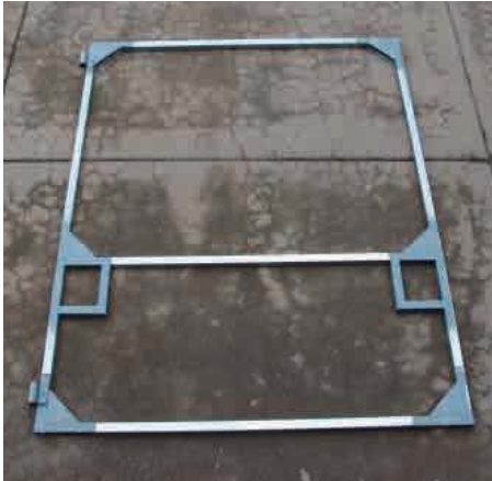
STEP 1. Open your Quick Frame gate kit & assemble your frame.