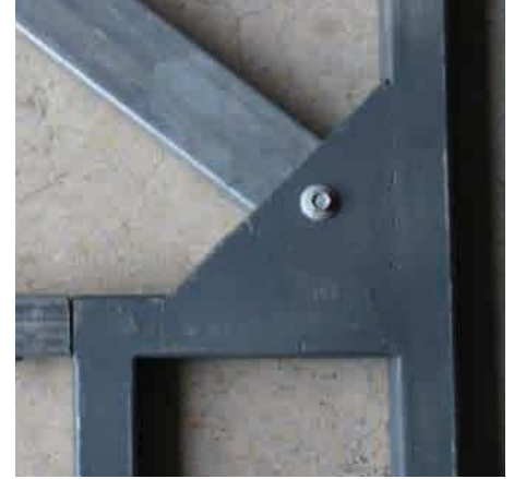
STEP 3. Re-assemble, confirm measurements & screw your Quick Frame gate kit together using the screws provided.